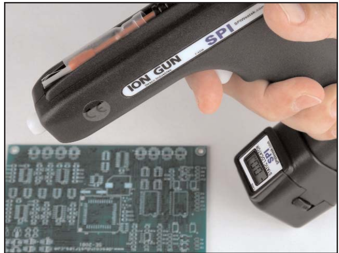
Figure 4. Using the SPI Static Locator with the SPI Ion Gun