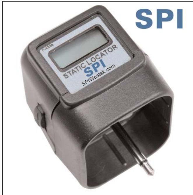
Figure 1. SPI Static Locator