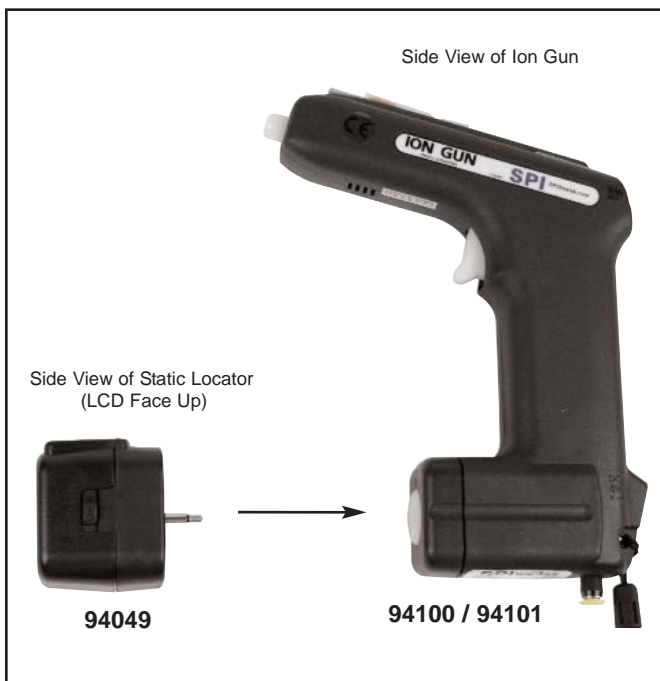
Figure 3. Connecting 94049 SPI Static Locator and 94100 / 94101 SPI Ion Gun