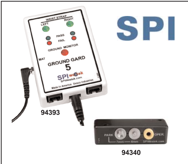
Figure 1. SPI Ground Gard 5